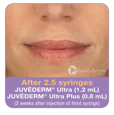
Unretouched photographs. Individual results may vary.

In the United States, JUVÉDERM® injectable gel is indicated for correction of moderate to severe facial wrinkles and folds (such as nasolabial folds).