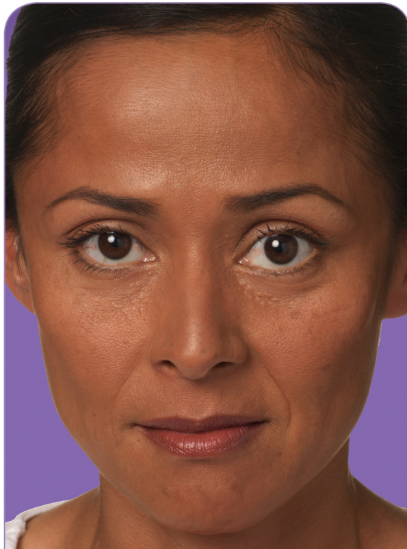
Before JUVÉDERM® treatment