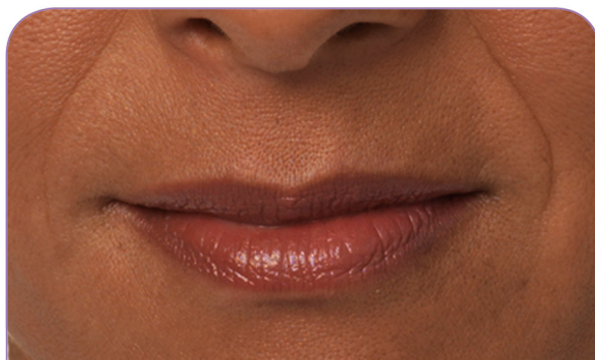
Before JUVÉDERM® treatment