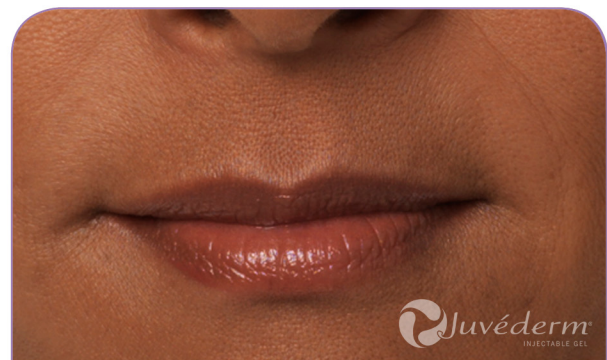
After 2 syringes JUVÉDERM® Ultra (1.6 mL)

Unretouched photographs. Individual results may vary.